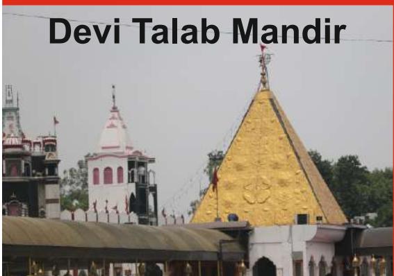
Devi Talab Mandir